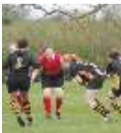
15-5 was the score as UYWRUFC recorded a memorable Roses win on Saturday afternoon