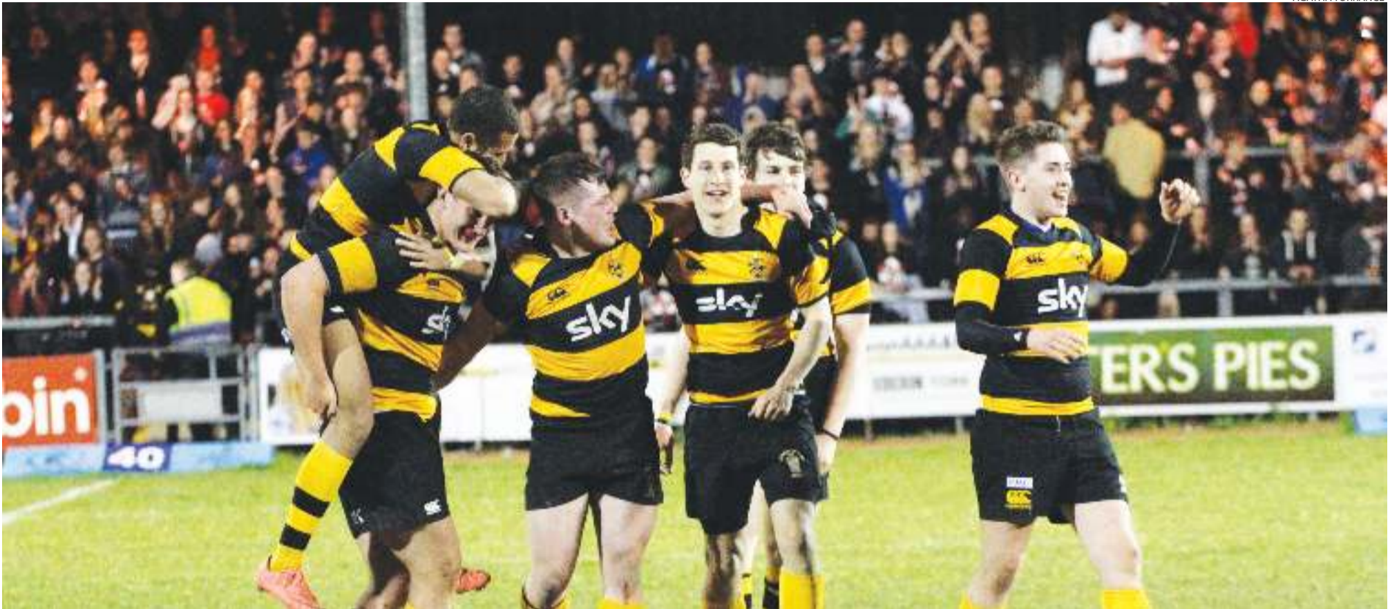
York's men's rugby first team romped to a stunning victory in Friday evening's Roses clash at Huntington Stadium, the first of three wins that secured a fifth consecutive UYRUFc whitewash