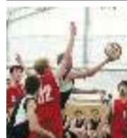
Men's basketball was one of the late fixtures won by Lancaster along with men's football and volleyball

One of the most heart breaking defeats of the weekend was the men's football firsts who lost 1-0.